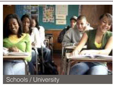
Schools / University