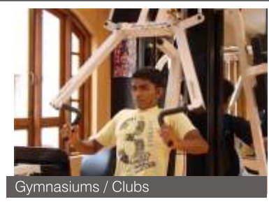
Gymnasiums / Clubs